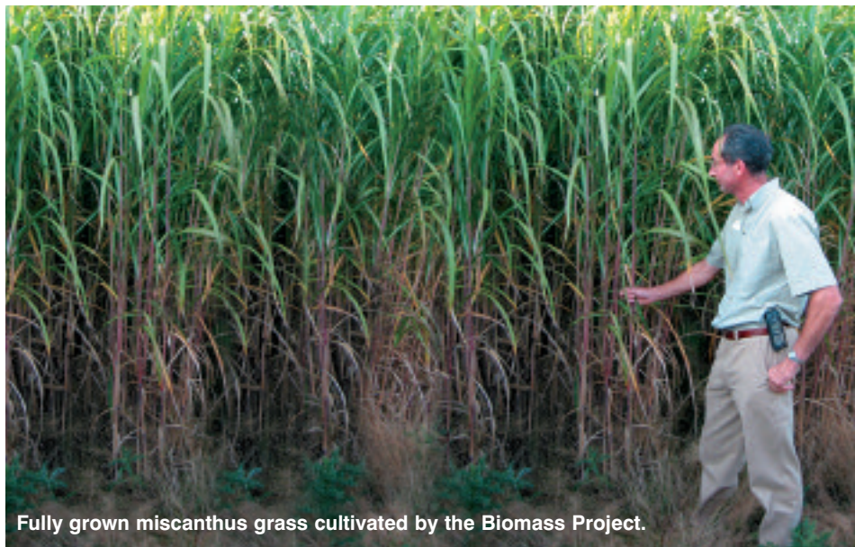
Fully grown miscanthus grass cultivated by the Biomass Project.

Through regular contact with local authorities, our MPs, MEPs, partner organisations and the West Midlands in Europe Office, the Chamber will ensure businesses in the Borough benefit from opportunities created by new environmental technologies.