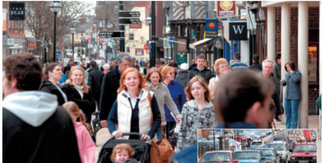
Stafford is entering an exciting time of regeneration – congestion must not be allowed to choke competitiveness.