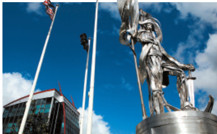
Staffordshire Technology Park, in Stafford, which is encouraging the growth and development of new business start-ups.

Maintaining close links with Instaffs UK and the regional development agency, the Chamber will help to encourage new business investment.